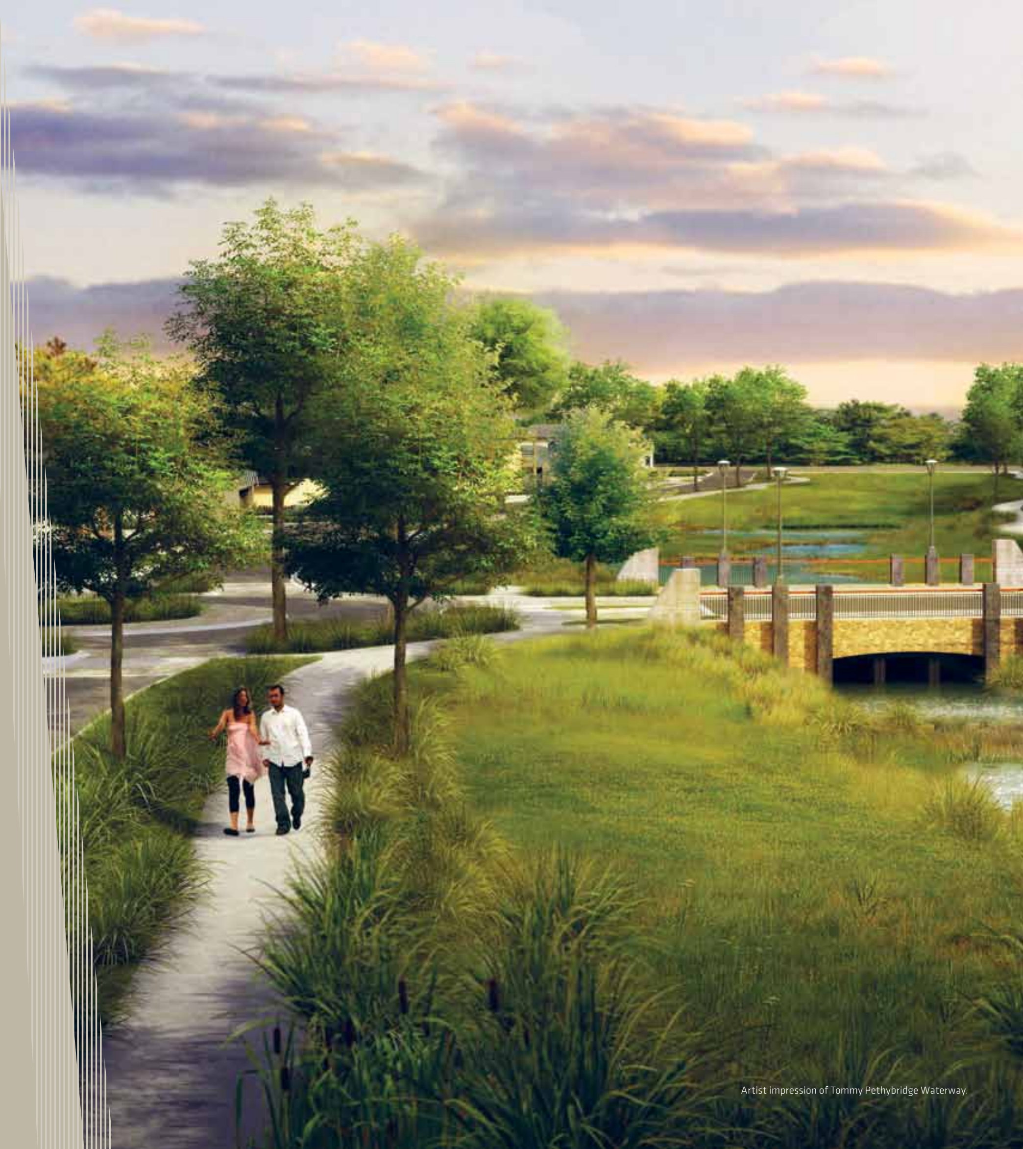
Artist impression of Tommy Pethybridge Waterway.