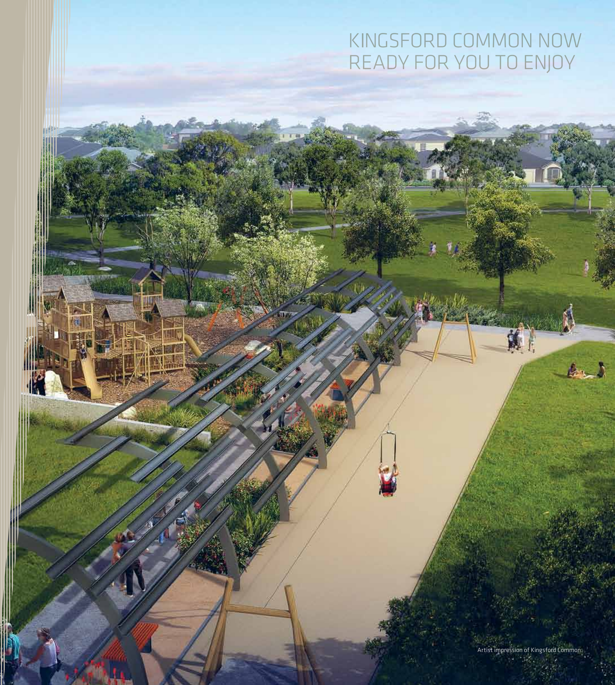
Artist impression of Kingsford Common.

KINGSFORD COMMON NOW READY FOR YOU TO ENJOY