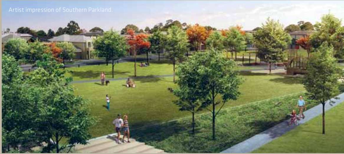
Artist impression of Southern Parkland.